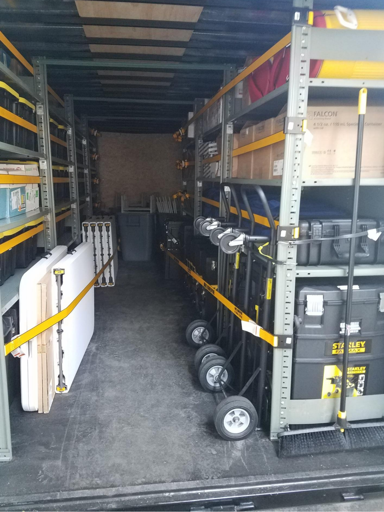
The URRT trailer allows us to be mobile. The trailer holds all our kits and supplies.