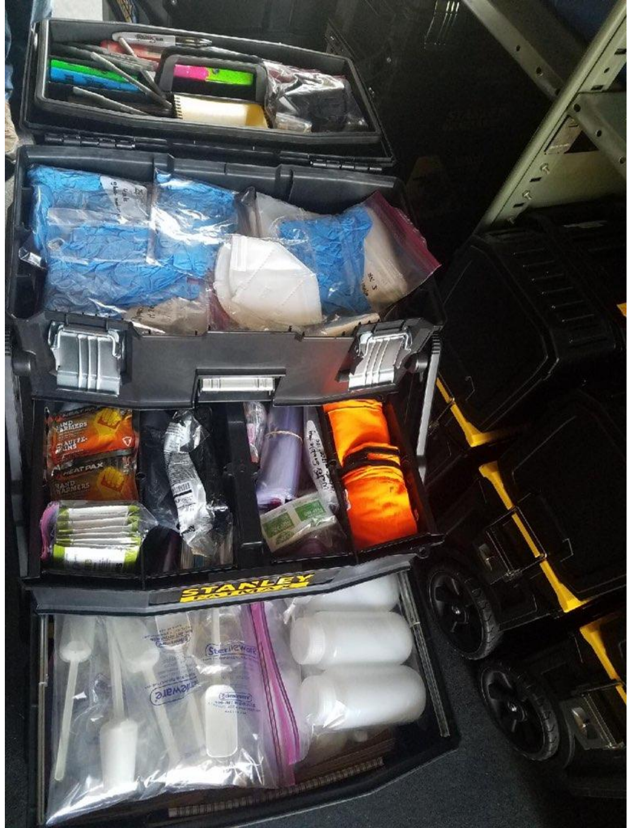
The General kits provide supplies for safety, sampling, and inspections. These kits fold out to the picture that you see. There are 6 general kits for the URRT.

During 2020 the URRT purchased equipment and supplies needed to set up a mobile Incident Command Post and conduct responses to food and feed related incidents throughout the State by putting together Go-Kits. These are a couple of pictures of what the Go-kits look like.